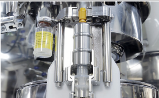
Support for vial/syringe